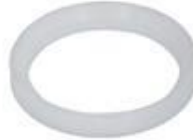
SPACER FOR BUSHING Ø 30X6X5 MM

LF Code: 9391012 GEV Code: 702030 OEM p/n: R40-34